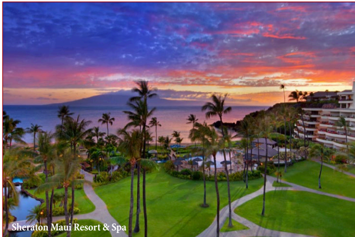
Sheraton Maui Resort & Spa

The Sheraton Maui Resort & Spa has two new culinary experiences designed to showcase the culturally vibrant island ingredients available in the island.