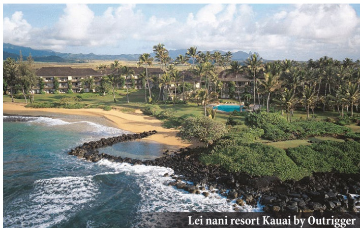
Lei nani resort Kauai by Outrigger

Outrigger Hotels and Resorts is reporting an increase in Hawaii room nights booked from New Zealand and to celebrate has released a new agent incentive.