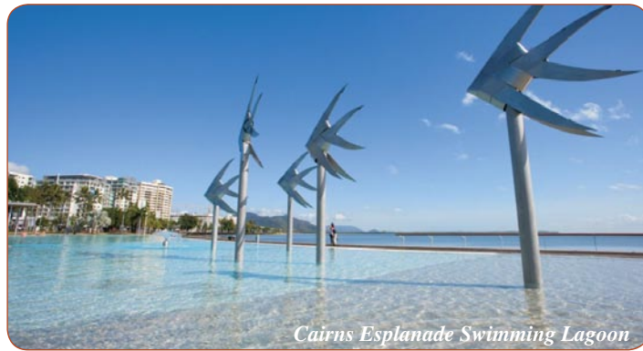
Cairns Esplanade Swimming Lagoon