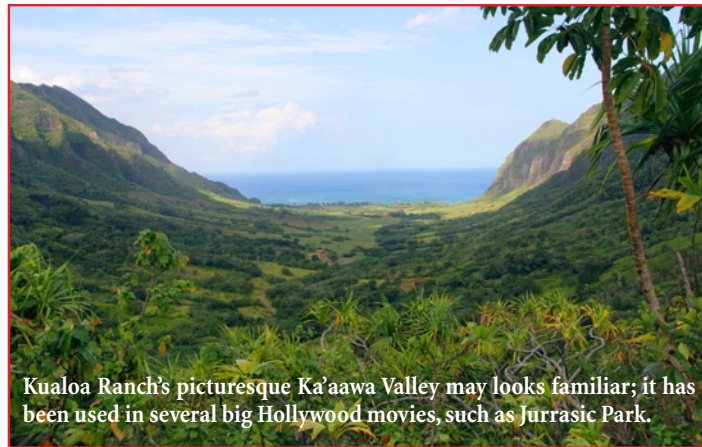
Kualoa Ranch's picturesque Ka'aawa Valley may look familiar; it has been used in several big Hollywood movies, such as Jurassic Park.