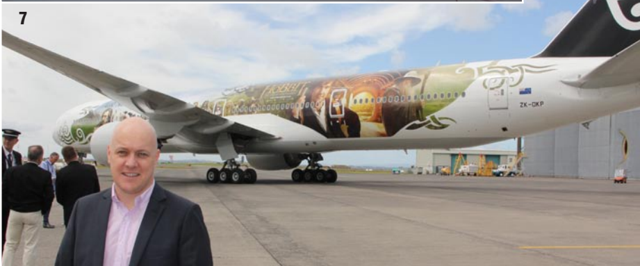
1: Current NZ CEO Rob Fyfe welcoming invited guests. 2: The "Hobbit 777" in all its glory. 3/4/5/6: Invited guests witnessed the dramatic unveiling of the aircraft before it was towed out onto the tarmac. 7: Air NZ's CEO-designate Christopher Luxon with the aircraft as a backdrop.