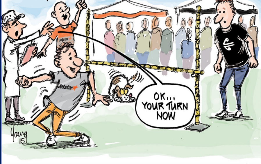
NEWS ~ JQ/NZ PRICE WAR