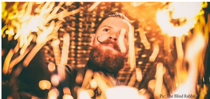
Pic: The Blind Rabbit

Anaheim is revered for its family-friendly offering, surrounded by theme parks, shops and a wide range of restaurants—but the city's edgy Packing House precinct is proving a hit for those looking for a different Anaheim experience.